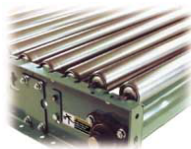
POP-OUT ROLLERS (some rollers raised for clarity)